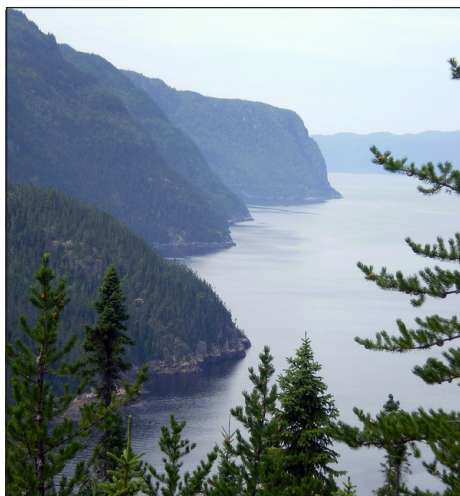
The beauty of the Saguenay Fjord delights us as we sail from Quebec City!